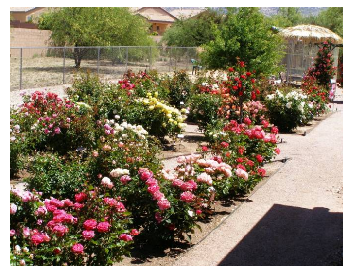
Roses in full-bloom showed their best to many visitors