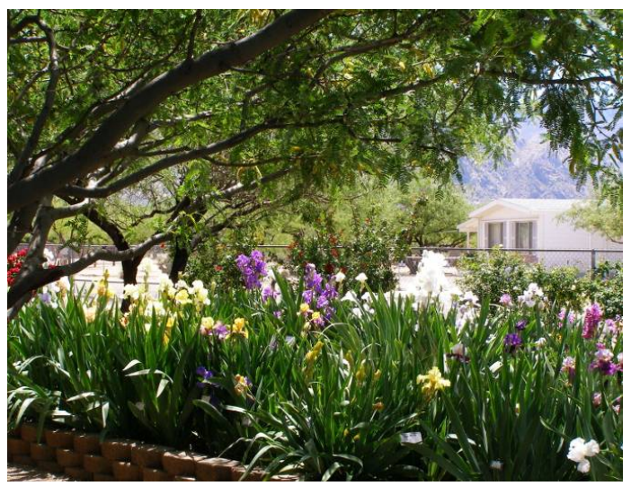
The cool of shade trees await visitors on the walkways