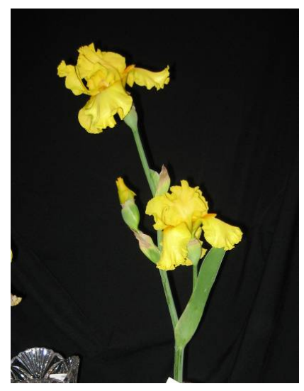
AZTEC GOLD Best Yellow Award