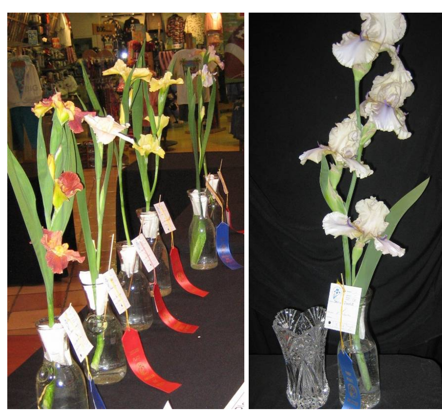
LOUISIANA IRIS DIVISION