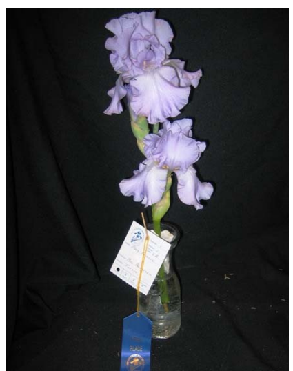
MARY FRANCES Voted Most Popular