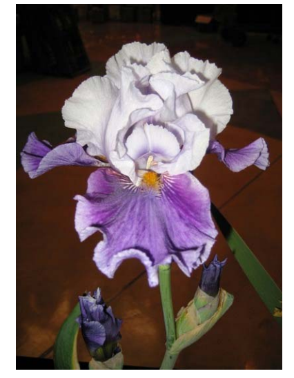
MAKING A SPLASH (Margie Valenzuela 2007 Introduction)