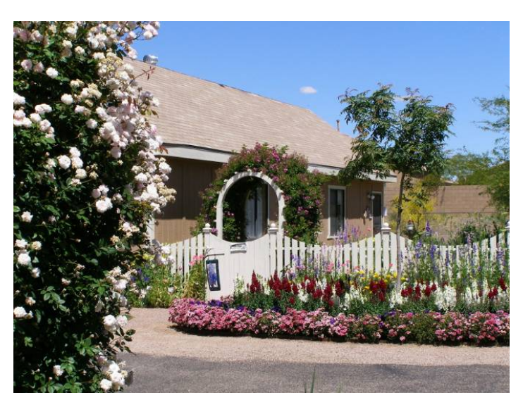
Rose arbors draw visitors along self-guided tours